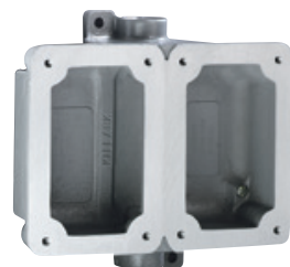
FXB-8 Double Gang Dead End

Class I, Div. 1 & 2, Groups C,D Class I, Zones 1 & 2, Groups IIB, IIA Class II, Div. I & 2, Groups E,F,G Class III NEMA 3, 7(C,D) 9(E,F,G)