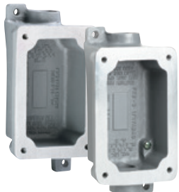
FXB-2 Dead End