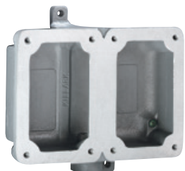
FXB-5 Feed Thru